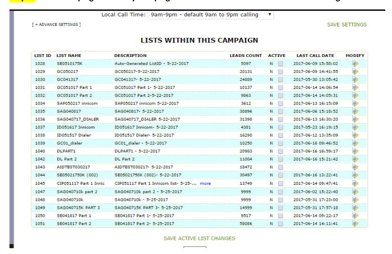
Step 1: Select Campaign → Modify Campaign → Select All Lists as Inactive before creating a List Mix

Step 2: Select Campaign → List Mix Tab → Select Modify List Mix